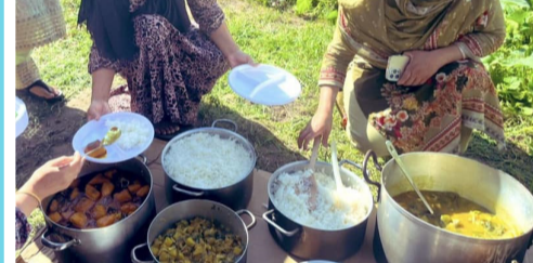
Bangladeshi Womens Association

Without Hyperlocal Fund I was unable to make Colchester Carnival and Concert to such a success, thanks to Hyperlocal Panel for awarding the Fund to Colchester Diverse Communities Network (CDCN). I am grateful