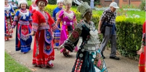
Colchester Diverse Communities Network