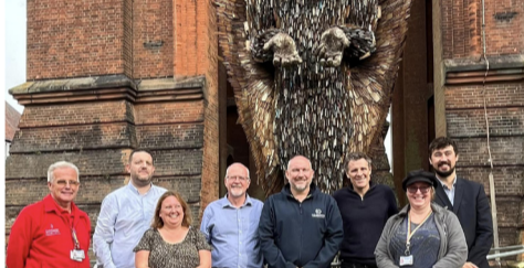
Colchester City Council